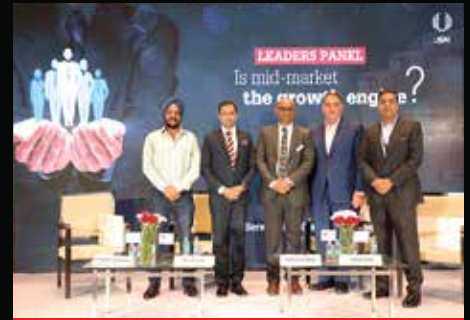
HOSPITALITY LEADERS PANEL