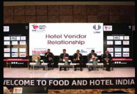
PURCHASE MANAGERS FORUM