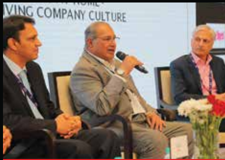
HOSPITALITY STRATEGY SUMMIT