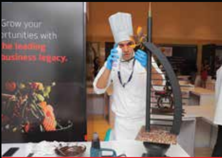
INDIA INTERNATIONAL CULINARY CLASSIC

FHIn 2018 hosted a wide range of world-class events staged during the three day show, supporting you and your target audience at every possible angle.