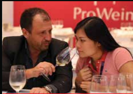
PROWEIN EDUCATION CAMPAIGN